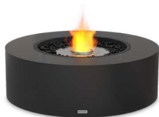
Graphite (ethanol model shown)