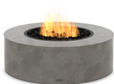
Natural (gas model shown)

This model complies with existing standards in the USA, Europe, UK and Australia. O-TL listed to UL 1370, EN 16647 BSI Certified and ACCC Safety Mandate compliant for bioethanol burners. LP/NG burners are UL/ULC listed to ANSI Z21.97-2017 and CSA 2.41-2017, and Gas Appliance Regulation 2016/426 as it applies to EU (CE) and UK (UKCA).