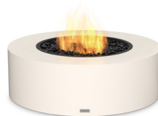
Bone (gas model shown)

Disclaimer. All product specifications and data are subject to change without notice and believed to be correct at the time of publication. MAD Design Group (MDG), its affiliates, agents, and employees, and all persons acting on its or their behalf (collectively, "MAD Design Group"), disclaim any and all liability for any errors, inaccuracies or incompleteness contained herein or in any other disclosure relating to any product. MDG disclaims any and all liability arising out of the use or application of any product described herein or of any information provided herein to the maximum extent permitted by law. The product specifications do not expand or otherwise modify MDG's terms and conditions of purchase, including but not limited to the warranty expressed therein, which apply to these products. No license, express or implied, by estoppel or otherwise, to any intellectual property rights is granted by this document or by any conduct of MDG. Customers using or selling MDG products not expressly indicated for use in such applications do so entirely at their own risk and agree to fully indemnify MDG for any damages arising or resulting from such use or sale. Please contact authorised personnel from MDG to obtain written terms and conditions regarding products designed for such applications. Images are indicative only.